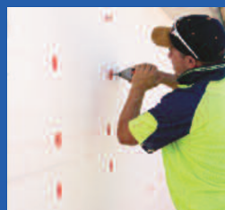
...quick to fix