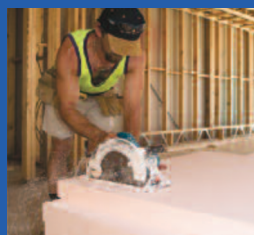
...easy to shape