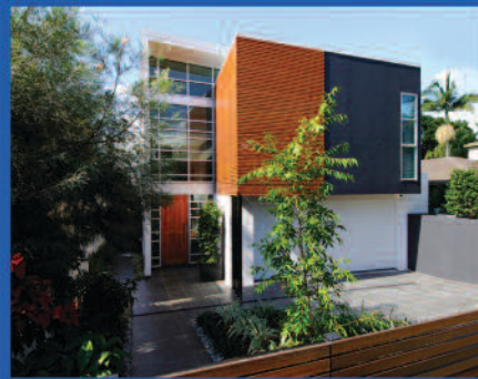
High Quality Finish

Orangeboard by AUSBLOX™ provides an exceptionally high quality finish and is also an ideal surface for most styles of painting and decorative rendering techniques.