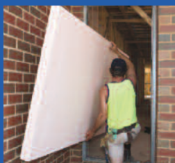
...light to lift

Orangeboard by AUSBLOX™ provides an exceptionally high quality finish and is also an ideal surface for most styles of painting and decorative rendering techniques.