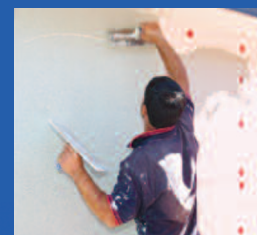
...perfect for render